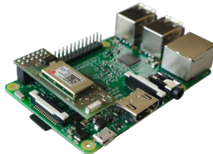
Raspberry Pi with RaspBee